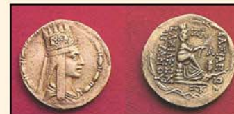
Silver coin by Tigran II 95 - 55 BC