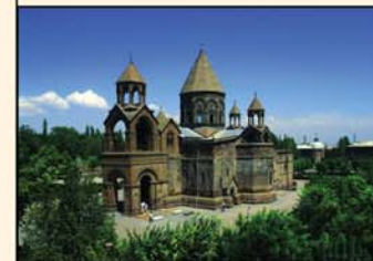
Holy Etchmiadzin Cathedral 4th - 17th centuries