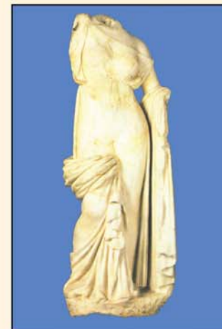
Marble Statue of Woman State History Museum of Armenia, 2nd c. BC.

Both triumph and despair pervade Armenia's rich, multifaceted history. Yet, as perennial survivors, despite seemingly continual shrinkage of its homeland, it's no wonder why present-day Armenians, wherever they reside, continue to survive and perpetuate their culture. They now breathe new life into a country torn apart by unwarranted destruction and are building on the glorious roots of Armenia's past.