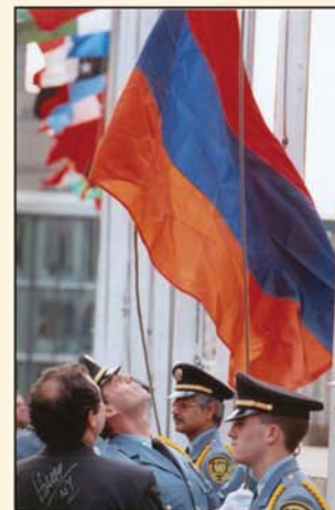
Flag-raising ceremony of Armenia's admission to the UN