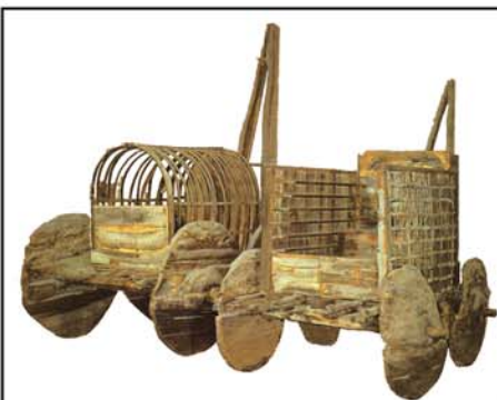
Wooden carts State History Museum of Armenia, 14th - 13th century BC from Lake Sevan

Find your own answer to the question Who Are The Armenians?