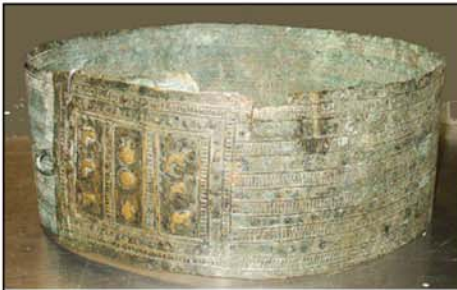
Urartian Warrior's belt with buckle In ALMA's collection 700 BC

All nations have a story to tell. The epic story of the Armenian people is a saga of cultural triumphs and survival as a people despite periods of oppression, destruction and even genocide. Armenians have always had an effusive spirit that carried them through disasters while reaching cultural heights. This nation was the first to adopt Christianity.