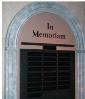
The memorial plaque by the permanent Genocide Exhibit