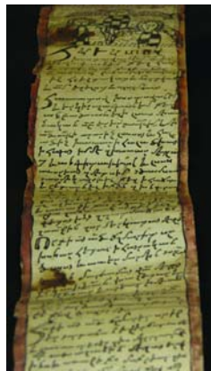
Hmayil on display at ALMA

viewed the exhibit while hearing Russell talk about the similarities in crude artistic styles and status of religious prayer scrolls. Russell also discussed the artistic works of insane and marginalized artists in Western cultures.