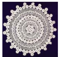
Armenian needle lace from ALMA's collections

Special collections, such as the Chad Collection of Laces (made by orphans of Malatia) and the Alice Riggs Collection (made by women of Aintab after the 1896 massacre), will be featured. Very fine lace collars, large doilies, three-dimensional flowers, household items and lace embellishing garments will be among the artifacts on display.