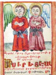
Illustration of hmayil on display at ALMA